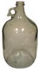
M. Glass bottle/jug