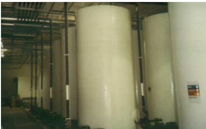
C. Tank Inside Building