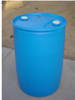
E. Plastic, non-metal drum