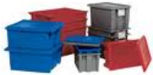
O. Tote Bin