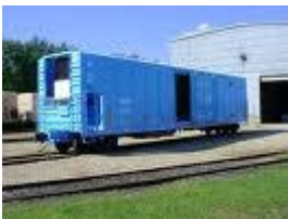
Q. Rail car

R. Other – any type of container that does not match or is not similar to the above pictures and descriptions