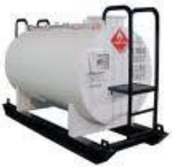
A. Above Ground Tank – liquid or gas storage