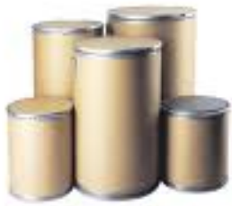
I. Fiber Drum