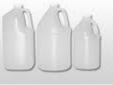
N. Plastic Bottle/jug