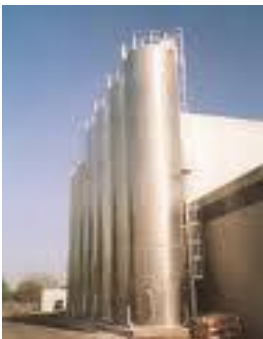
H. Silo – an outdoor, above ground tank which holds non-liquid material