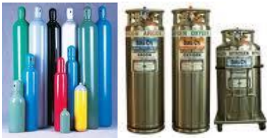
L. Cylinder – gas or cryogenic