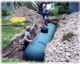
B. Below Ground Tank